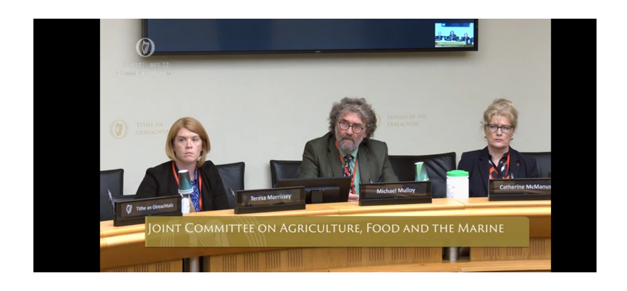
The Challenges facing the Aquaculture Industry Wednesday 21<sup>st</sup> September 2022